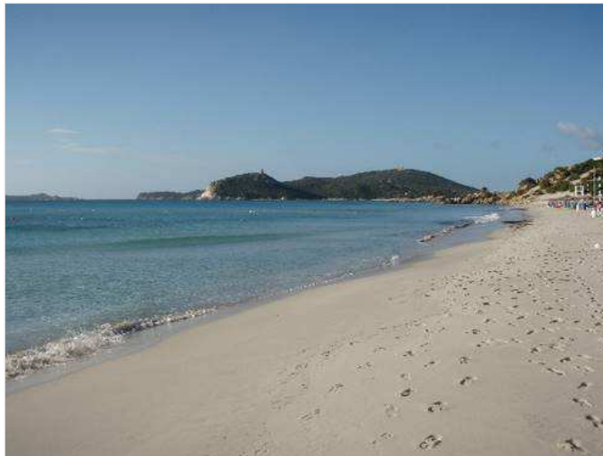
Deceptively calm conditions before the race!

This hotel is like Mauritius in that it has all the facilities including, yes you will never guess surfskis to rent. The package included all meals and all drinks (that is beer, wine and water!). This place is amazing, and a great venue for a race base.