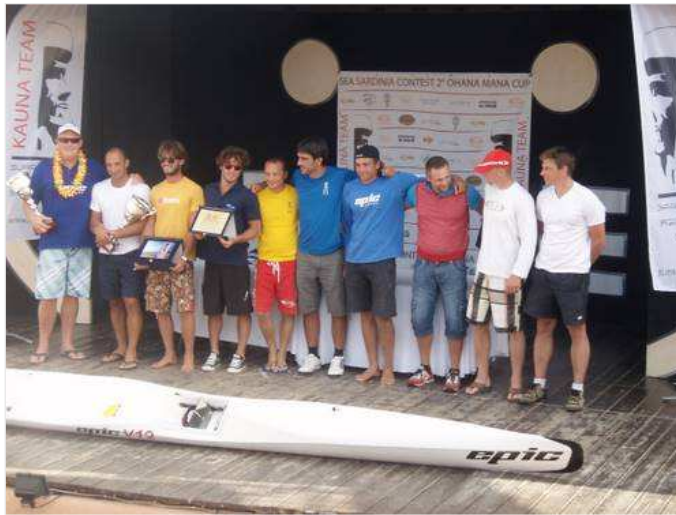
The top 10 line up